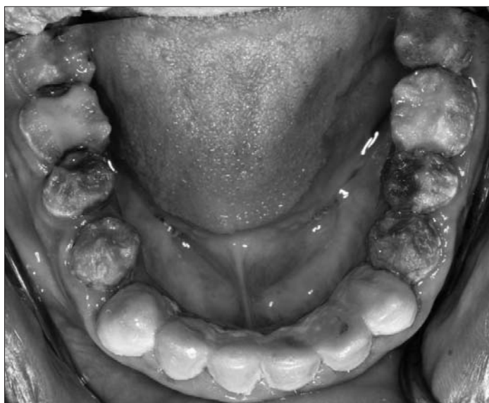
Figure 1. Amelogenesis Imperfecta

and maxillofacial surgeon. The pediatric dentist can preserve and maintain the primary dentition with stainless steel crowns. He or she can also preserve the mixed dentition with full coverage crowns to correct for enamel hypoplasia, which causes severe tooth sensitivity and lack of masticatory function. These patients will require continuous care; therefore, transitional restorations are placed, to maintain the dentition from childhood to adulthood. For example, pits, fissures and grooves can be restored with composite on teeth with minor AI. Minor enamel hypoplasia can be restored with flowable and filled resins, which reduce enamel sensitivity to decalcified areas. In cases of minor hypoplasia of anterior teeth, veneers can be fabricated.